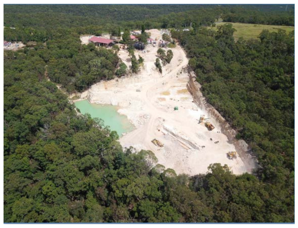
Site – view looking South West (towards Smallwood Road)