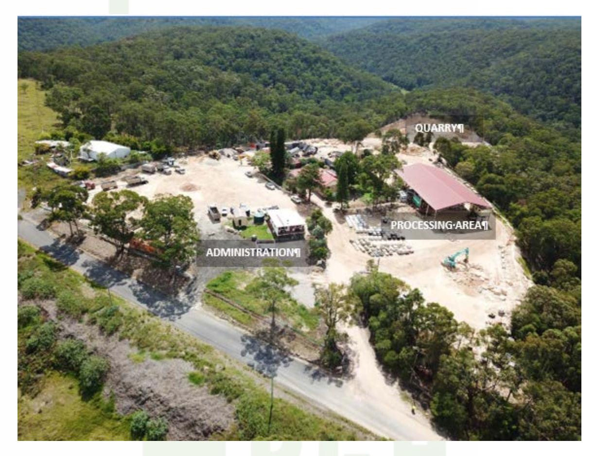
Site - view looking North East (from Smallwood Road)